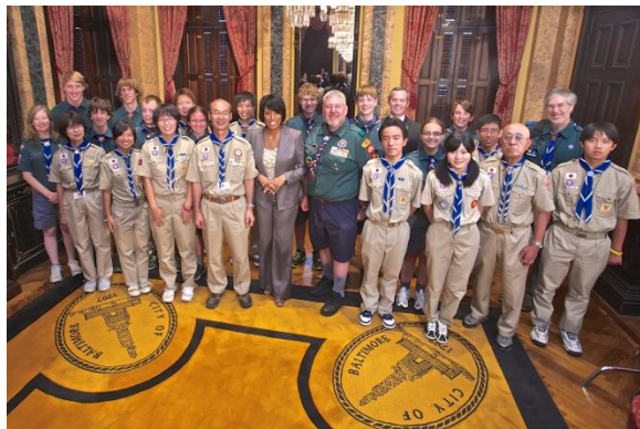
Above: Scouts from Kawasaki, Japan visit the City of Baltimore.

In regards to the logistics associated with the steps required to form Baltimore Sister Cities, Inc., the anticipated total cost in year one of operation is $969 - $1,719, plus any insurance premiums for BSC, Inc. and its Board. The preparation of the required documentation (Articles of Incorporation, Bylaws, budget, etc.) ideally, can be completed within 90 days, and the subsequent incorporation process requiring an additional 30 days. The biggest unknown is obtaining 501(c)(3) status from the IRS, as the Maryland Sister States program has been waiting for more than a year for such approval. Baltimore's Sister Cities presently benefit from tax-exempt status by virtue of being a part of the City. This will have an important bearing on how soon the organization can fully separate from the City financially.