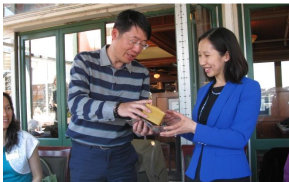
Above: Dr. Wen, the City's Health Commissioner, receiving a gift from the Xiamen- Sister City delegation.

With a close relationship with the City of Baltimore, BSC, Inc. can also bring value to the City in areas such as foreign business and investment, neighborhood development, educational exchanges, arts and culture, immigrant relations, language skills and international knowledge.