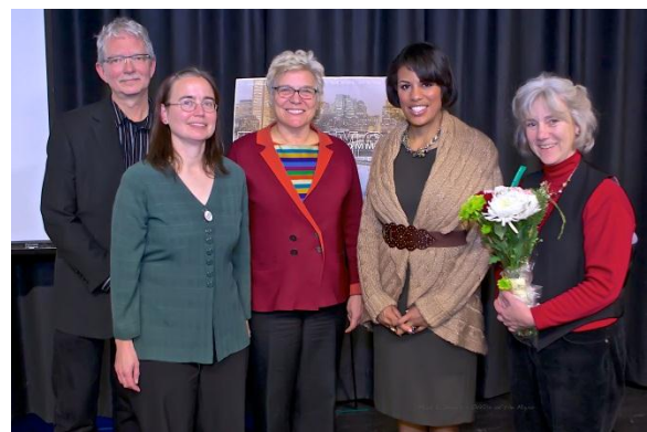
Above: Reception for the Baltimore-Rotterdam Artist Residency in 2013.

The Rawlings-Blake Administration is committed to ensuring Baltimore City is a “Welcoming City”. In 2014, the Mayor established the Mayor's Office of Immigrant and Multicultural Affairs. In addition, the Mayor's New American Task Force issued a detailed report with 32 recommendations for ensuring Baltimore City is making strong efforts to attract immigrants and help ensure their success as new residents and business owners. The Sister Cities program can be a powerful resource for the City of Baltimore's efforts to connect globally and locally with its immigrant population.