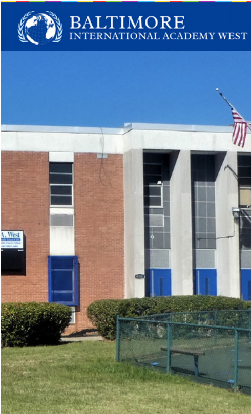
BPSCC members read Greek mythology stories to young students.

including fundraising, donations, & membership dues