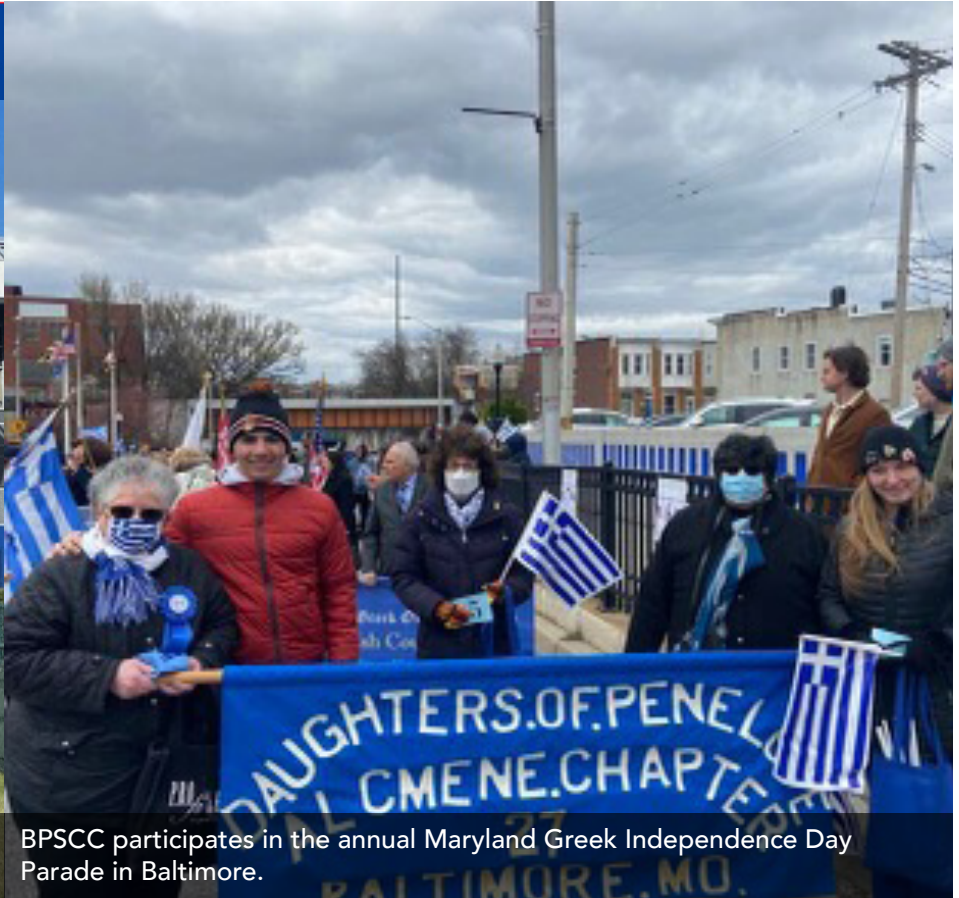
BPSCC participates in the annual Maryland Greek Independence Day Parade in Baltimore.