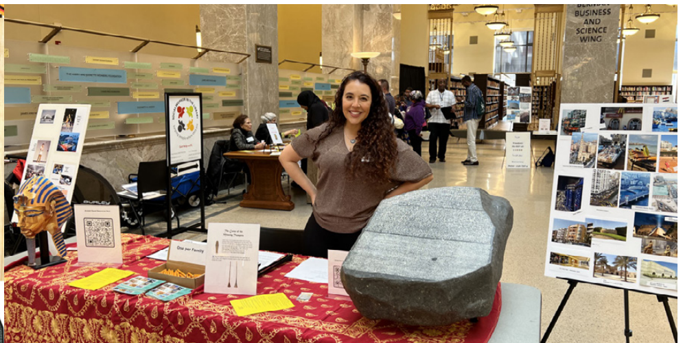
Celebrate King Tut, the Rosetta Stone and Modern Egypt — activities for young & old at Enoch Pratt Free Library.