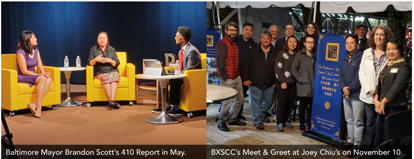
Baltimore Mayor Brandon Scott's 410 Report in May.

including fundraising, donations, & membership dues